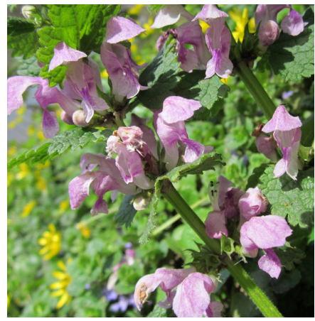
Lamium "Pink Pewter" -0-6-8 in.