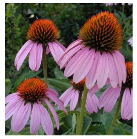
Coneflower -☆- 2-4 ft.