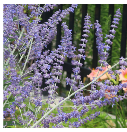
Russian Sage -☆- 3-4 ft.