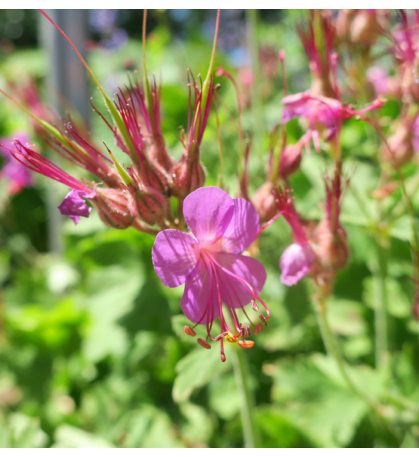
Geranium Macrorrhizum 10-12 in.