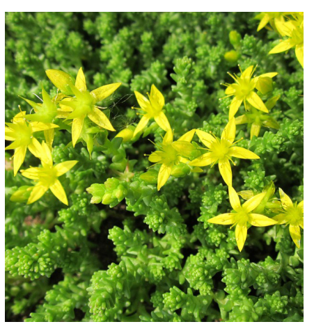
Mossy Stonecrop -☆- 2-4 in.