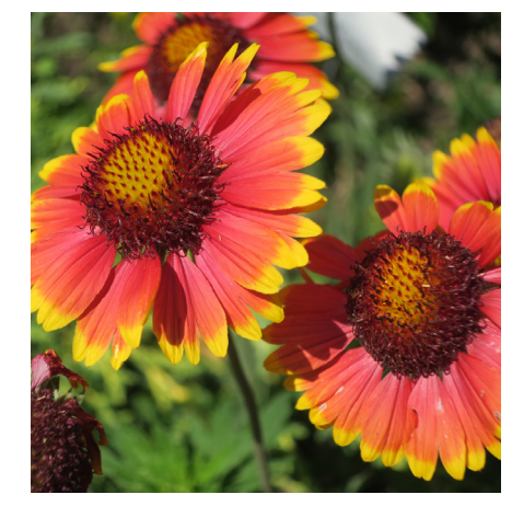
Gaillardia -☆-1-2 ft.