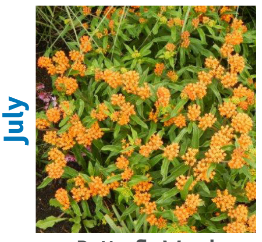
Butterfly Weed -☆- 2-3 ft.