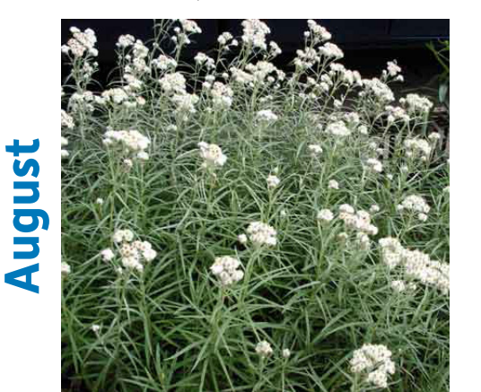
Pearly Everlasting -☆- 2-3 ft.