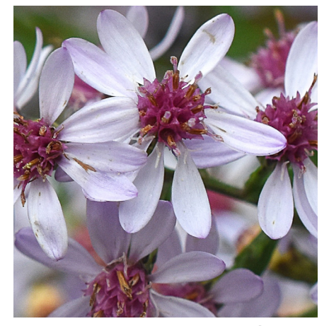
Aster "Heartleaf" -☆- 2-3 ft.